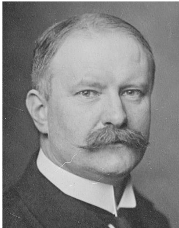
August Bier (public domain image)

The rapid rise in the clinical application of both cocaine and spinal anaesthesia inevitably led to case reports of complications and highlighted the limitations of cocaine as a local anaesthetic. The following 100 years were dedicated to improving safety including