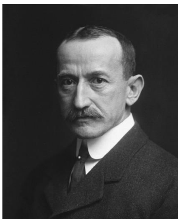
Carl Koller

The technique was demonstrated at a conference in Heidelberg (5) and Koller rocketed to scientific stardom. Surgery to the