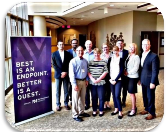
Some of the team on the fact-finding trip to Chicago

We eagerly anticipate updates and news on this innovative project from our colleagues at ROHFT!