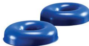
CS Knee Rings (pair) CSM-2821