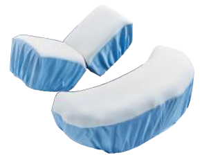
CS Comfort Covers CSM-2601