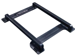
CS Spine Frame CSM-2712