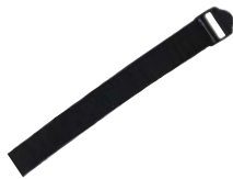
CS Straps CSM-2712-4