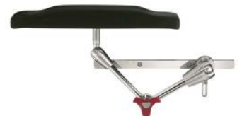
Fisso Armboards 6646.01