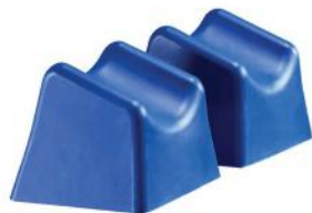
CS Shin Supports (pair) CSM-2820